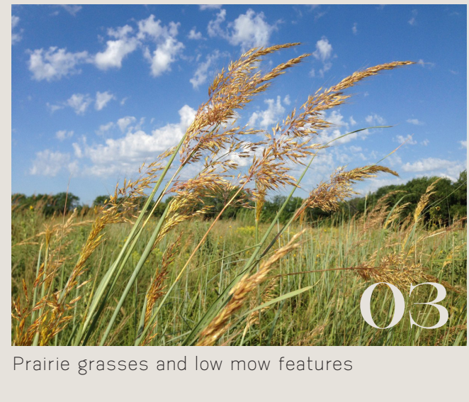
Prairie grasses and low mow features