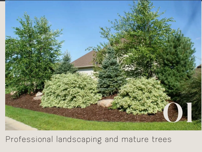
Professional landscaping and mature trees

Located 5-10 minutes from downtown Rochester, in a quiet and peaceful setting, secluded from the highway.