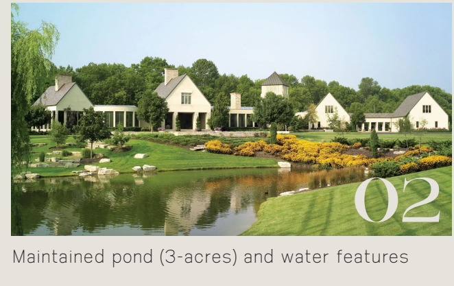
Maintained pond (3-acres) and water features