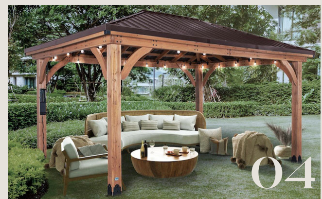
Gazebo and walking paths with miles of connectivity